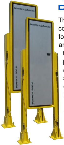
▲ RS-400/10000 2 detector system