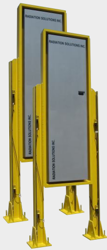
▲ RS-400/10000 2 detector system