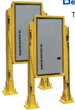
▲ RS-300/6000 2 detector system