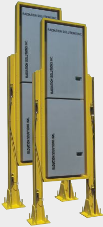
▲ RS-300/12000 4 detector system